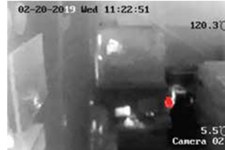
Optical / Thermal / Fire detection analytics (Oculus/ Magma/Firebird Series)