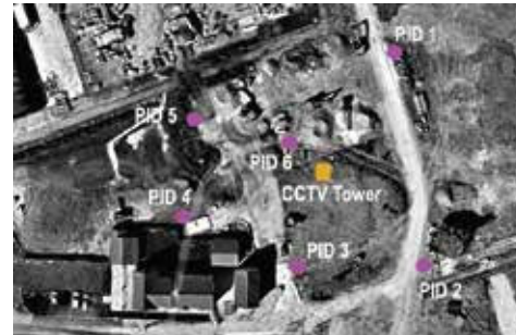
HD PTZ with PIDS's system (Raptor Series)