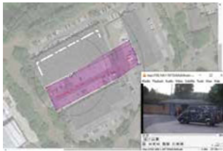
Radar multi object tracking (Kraken Series)