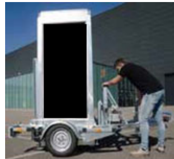
The Tower Trailer

The cabinet is fully CE marked, and features a ratchet handle or electrical extending mast, meaning the tower can be deployed in minutes after arriving at a site. The size of the cabinet offers the advantage that there is no extra separate cage or mounting equipment required for the use of gas storage or solar panel siting. This cabinet itself provides a number of options either for product branding or advertising, or indeed camouflage using one of our tower wraps to achieve this.